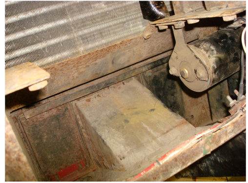
FIG. 2 Remove Blower Housing