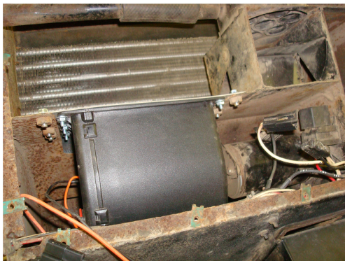
FIG. 3 Install New Assembly