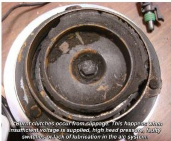
"Burnt clutches occur from slippage. This happens when insufficient voltage is supplied, high head pressure, faulty switches or lack of lubrication in the a/c system.