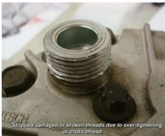
"Stripped/damaged or broken threads due to over-tightening or cross thread.