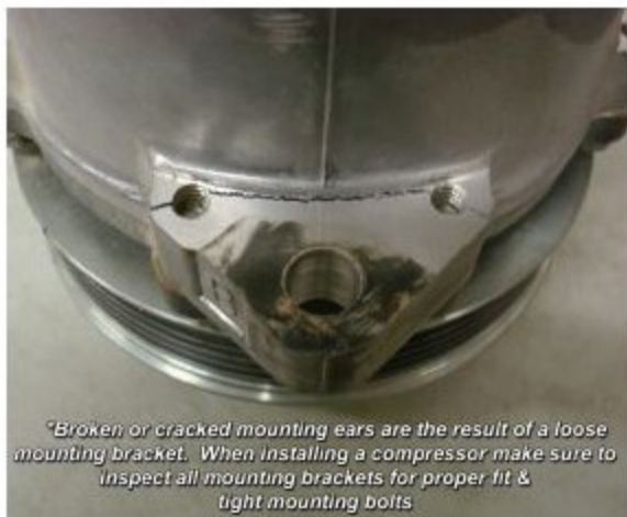
"Broken or cracked mounting ears are the result of a loose mounting bracket. When installing a compressor make sure to inspect all mounting brackets for proper fit & tight mounting bolts