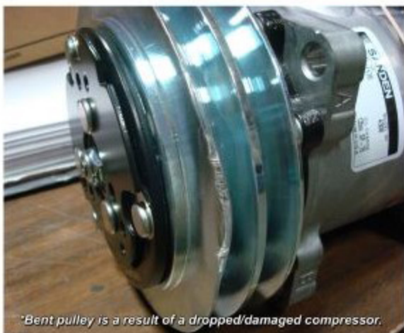
"Bent pulley is a result of a dropped/damaged compressor.