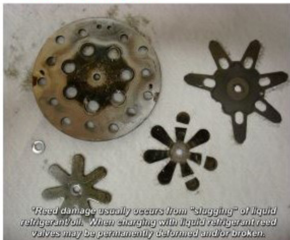
"Reed damage usually occurs from "slugging" of liquid refrigerant/oil. When charging with liquid refrigerant reed valves may be permanently deformed and/or broken.